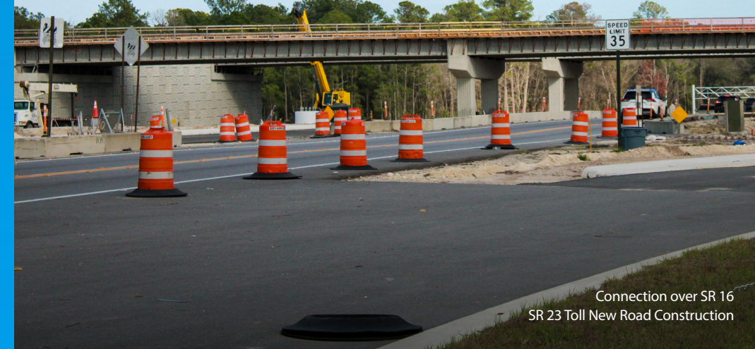
Connection over SR 16 SR 23 Toll New Road Construction