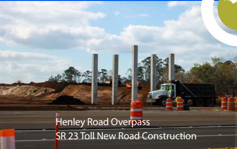
Henley Road Overpass SR 23 Toll New Road Construction